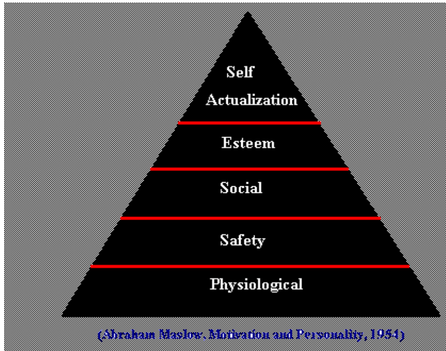
Figure 1: Abraham Maslow's Hierarchy of needs

Maslow's theoretical position is that people are basically good and that they have an innate need to be competent and accepted. Unproductive behaviours, therefore, not viewed as an indication of bad child, but rather as a reaction to frustration associated with being in a situation in which one's basic needs is not being met. Maslow suggests that these needs cannot be met without assistance from other people. He suggests that only when the basic needs are being met, can the individual be motivated by self-actualization or the need to take risks, learn and attain one's fullest potential.